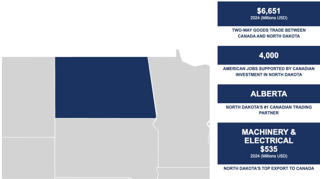
North Dakota's top 5 export products 2024 (Millions USD)

Canada is a critical and reliable partner , supplying energy, critical minerals, autos, and key inputs for U.S. industries. Protecting this trade partnership is essential.